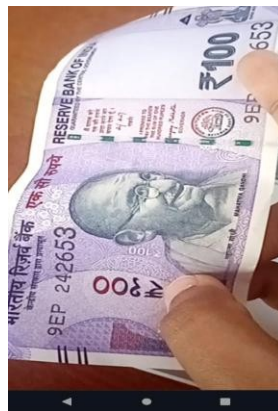
fig. 2. Real-Time Currency Detection Using Mobile Camera

Overall, the results demonstrate that the proposed system is capable of performing real-time currency detection and authentication with satisfactory accuracy and usability for assistive applications.